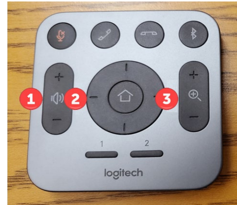
Camera Remote Diagram